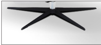
OPTION 2: STAINLESS STEEL BASE TITANIUM FINISHING