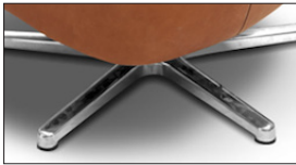
OPTION 1: STAINLESS STEEL BASE